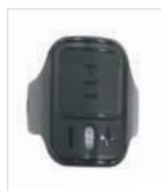
Wireless Finger PTT