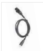
Programming Cable (USB Port)